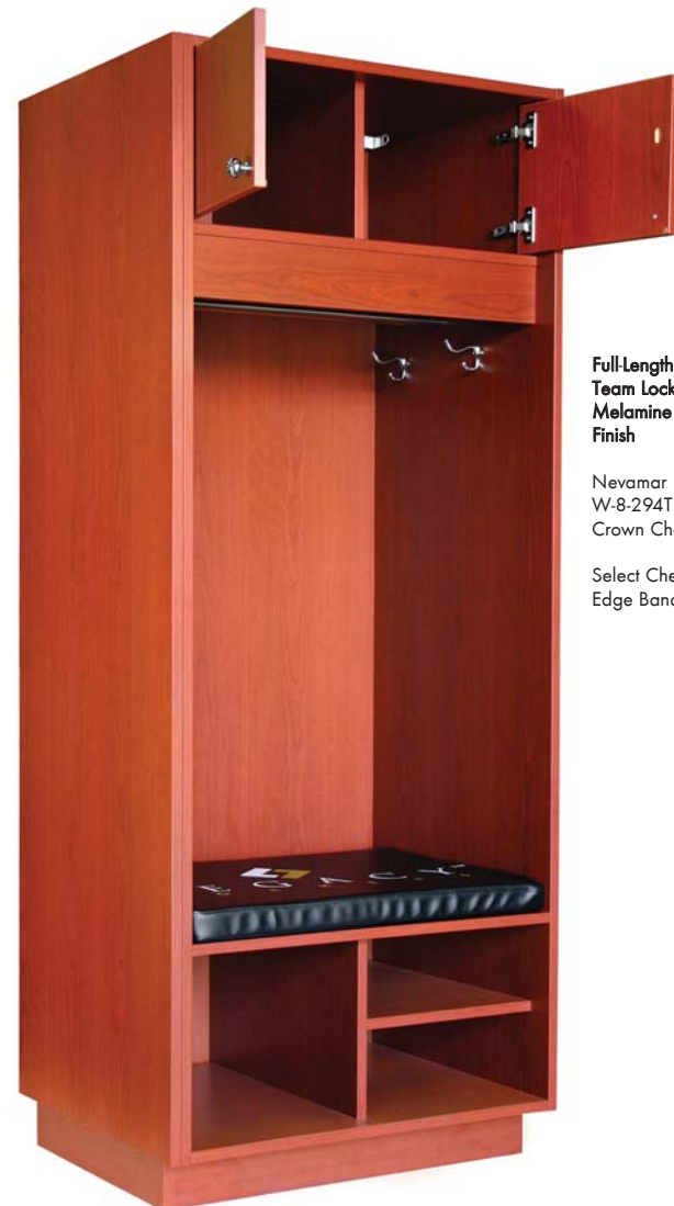
Full-Length Team Locker Melamine Finish