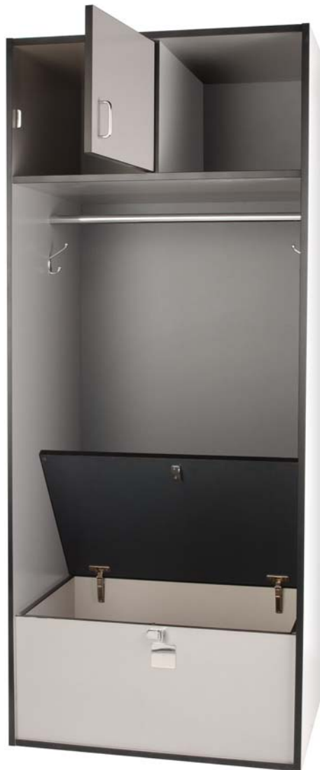
Full-Length Team Locker Laminate Finish