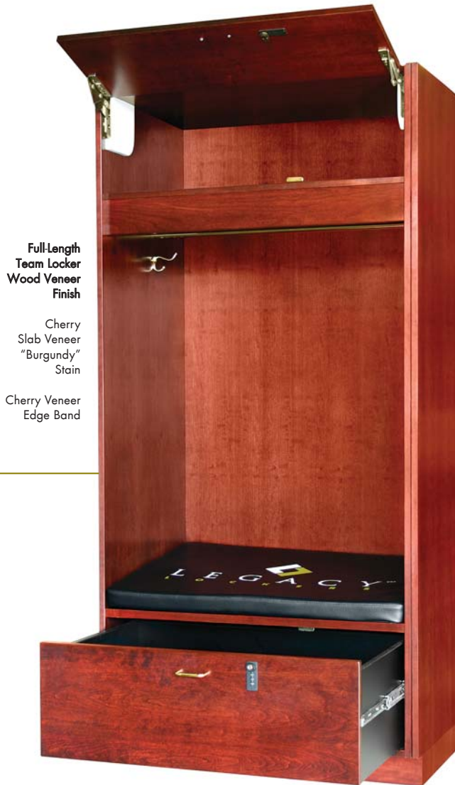
Full-Length Team Locker Wood Veneer Finish