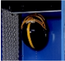
Coat Rod 2 Coat Hooks