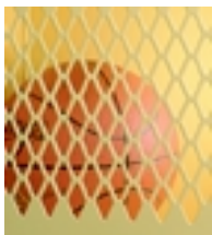
16 GA. Side Panels Diamond Perforated (Solid Available)